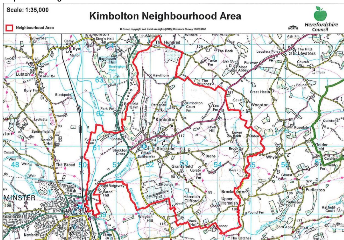
Map 1 – the Neighbourhood Plan area

1.0.2 The area is in the main deeply rural, tranquil and retains much of its traditional historic character. The landscape of the Parish is in two distinct parts - the central and eastern areas are made of up gently rolling elevated countryside which rise steeply out of the Herefordshire lowlands and provides a number of spectacular far-reaching views to the north and north-west. The western parts of the Parish are low-lying and contain important transport routes linking north Herefordshire with Shropshire. Here, the impact of modern farming practices and development pressures is more obvious, reflected in the open character of the landscape, and the presence of large commercial buildings.