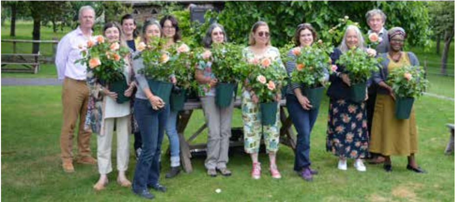
Gardening press gather for Rose of the Year launch

Opinions expressed in this publication are not necessarily those of the editorial team. We are not responsible for goods and services advertised. All contributions may be edited at the discretion of the editor