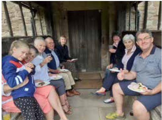
Worshippers at Middleton-on-the-Hill enjoying the Bread and Beer lunch

Opening times are 12–2.30 every day except Wednesday when they are closed all day. On Saturday it's 12 – 3pm. In the evenings they open at 6.30 each day (except Wednesday).