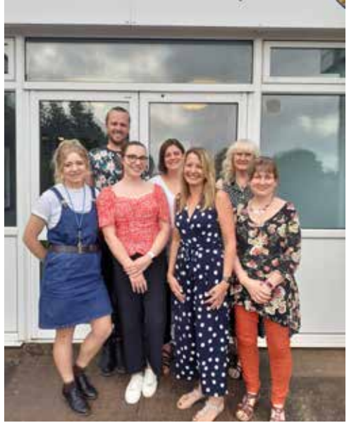
Teachers gather for the new term at Kimbolton