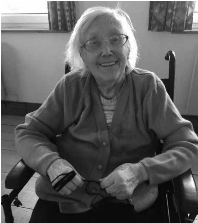
Woolpack Knitters have a stall at the Tenbury Show on 6th August. Raising funds for The Midlands Air Ambulance Charity.

Look out your wool and needles, it's obviously the answer to health and happiness.