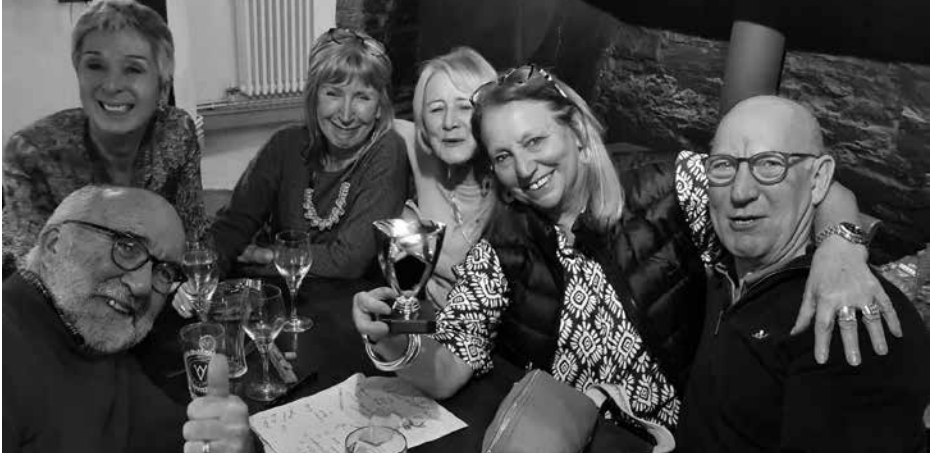
The winning team was 'Back to the Fire' (tie break with 'Top of the Crops').

The October Quiz at The Stockton Cross pub kicked off the winter season with a bang, and raised £143 for your Roundabout Magazine. Thank you from us all. The next one will be on December 7th, in aid of Parkinson's Disease.