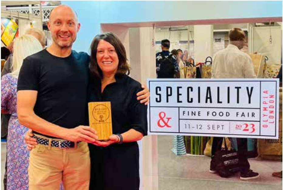
Roundabout advertiser wins top award, see page 5