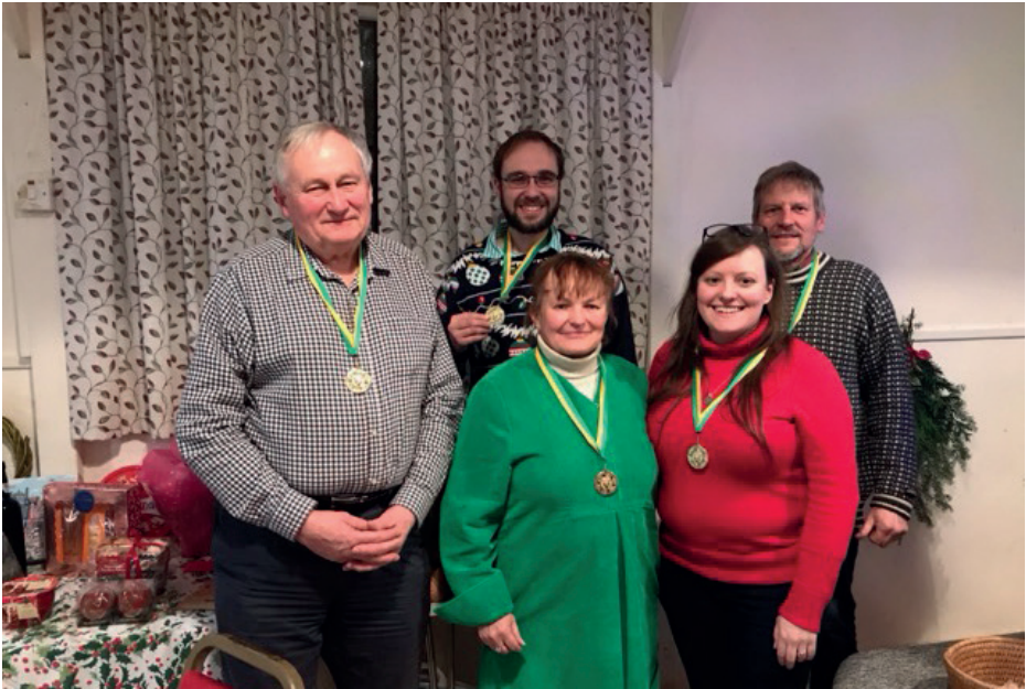
Happy medal winners at Bockleton's Christmas skittles evening