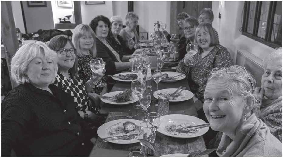
Kimbolton WI recently enjoyed a birthday lunch in Docklow