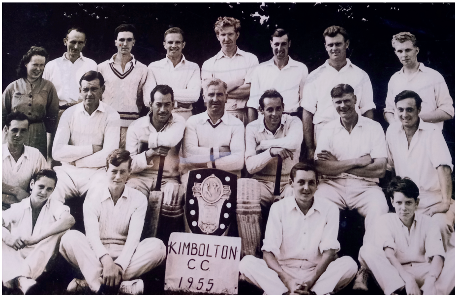
Kimbolton cricket team 1955 L-R