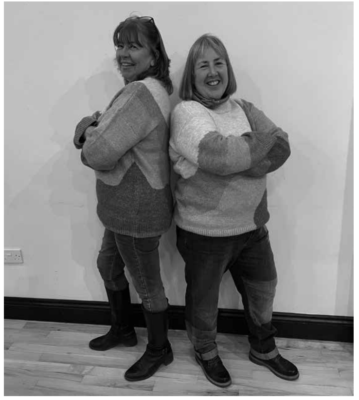
Snap! two members of the WI show how much members have in common... when they chose the same outfit!