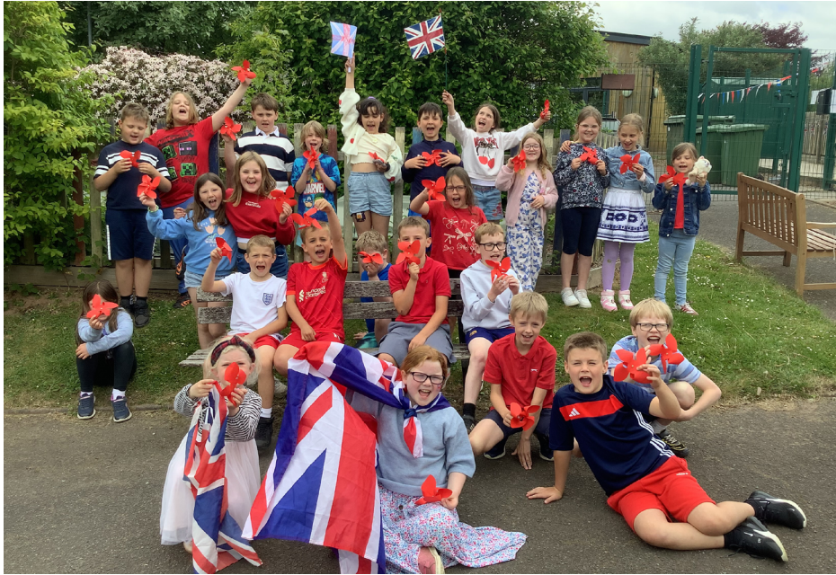
VE Day celebrations in Class 3 at Kimbolton school (See page 4)