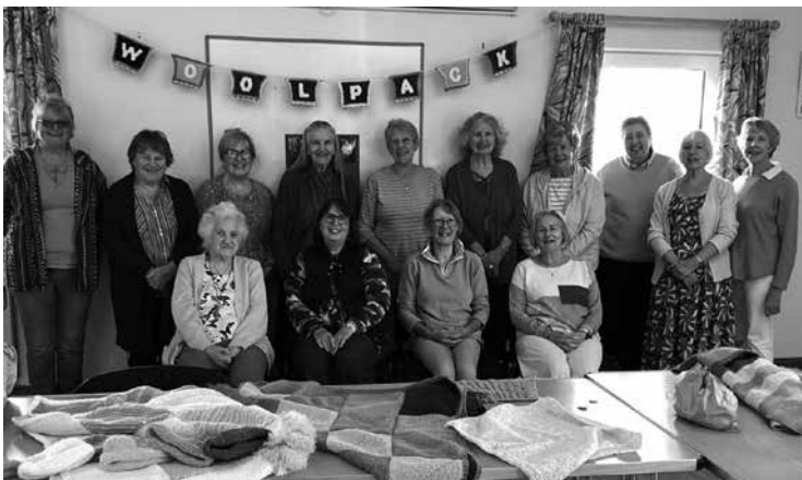
Woolpack knitters have recently celebrated ten years' together by handing over £900 to the Midlands Air Ambulance charity too.