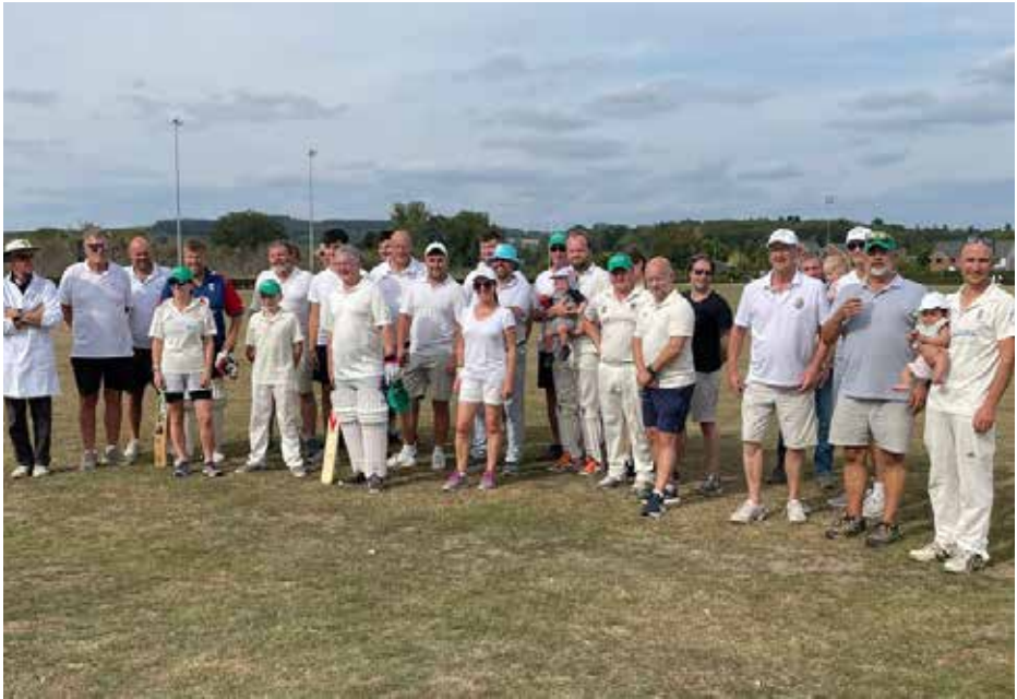
HOWZAT....LOCAL CRICKETERS AT THE ANNUAL MATCH (see page 5)